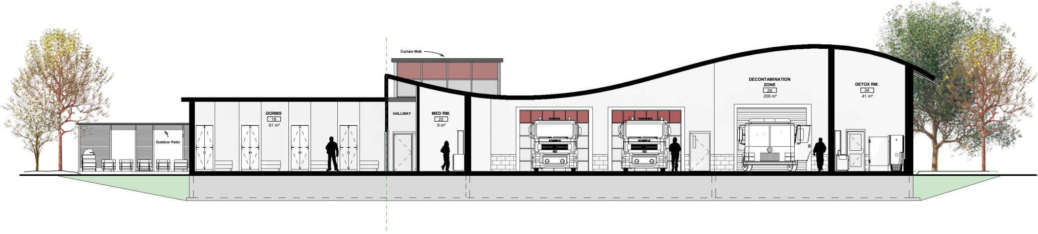
PROPOSED NORTH-SOUTH BUILDING SECTION